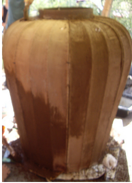
Ferro-cement Thai Rain Jar