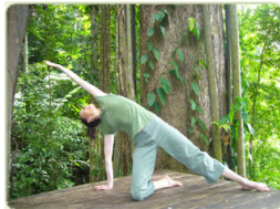
Yoga in the Woods. Relax, Rejuvenate, Recharge.